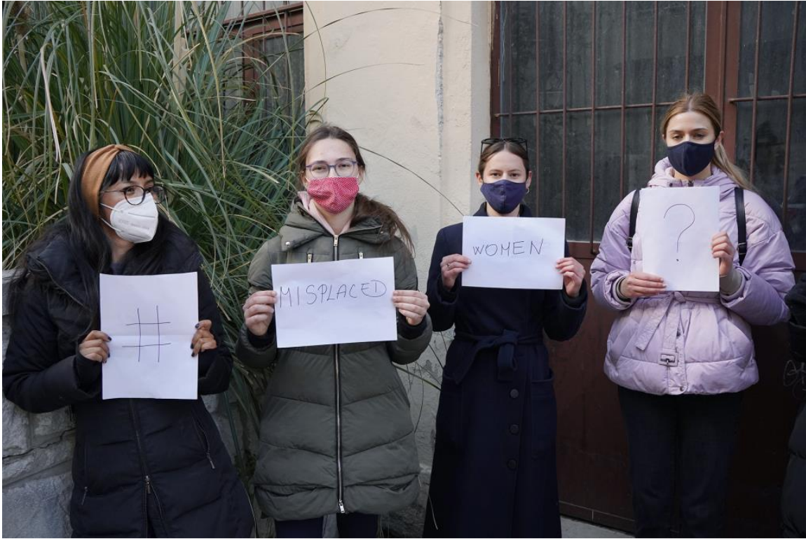
Culture Hub Croatia: Misplaced Women? Misplaced Organisation?, Split, Voids2021