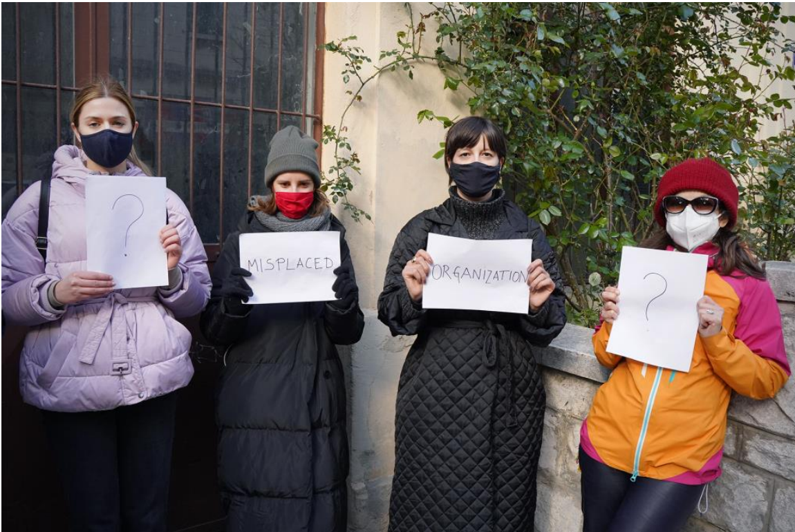
Culture Hub Croatia: Misplaced Women? Misplaced Organisation?, Split, Voids2021