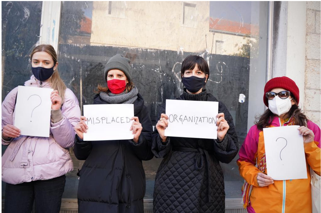
Culture Hub Croatia: Misplaced Women? Misplaced Organisation?, Split, Voids2021

This performative act is static, reluctant to the movement, has had enough of nomadism.