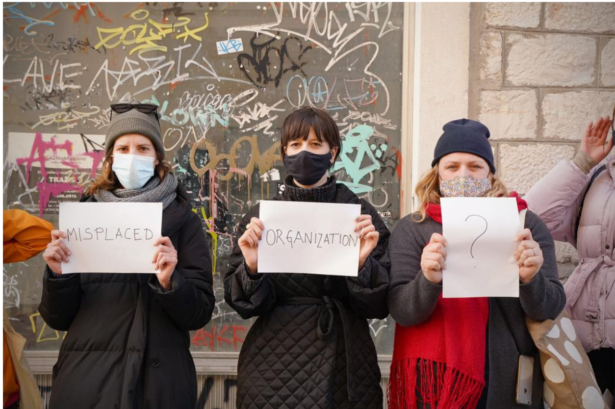
Culture Hub Croatia: Misplaced Women? Misplaced Organisation?, Split, Voids2021