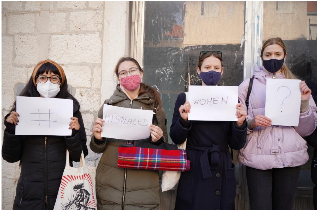
Culture Hub Croatia: Misplaced Women? Misplaced Organisation?, Split, Voids2021

For our performative actions during the “Misplaced Women?” workshop, we’ve decided to tackle our situation, to visit two of those spaces: one at the crossing of Natka Nodila & Kralja Tomislava streets, and the other in Kneza Višeslava street, and to mark them in a way, positioning our bodies in front of them, holding the signs: “MisplacedWomen?” and “Misplaced Organisation?”.